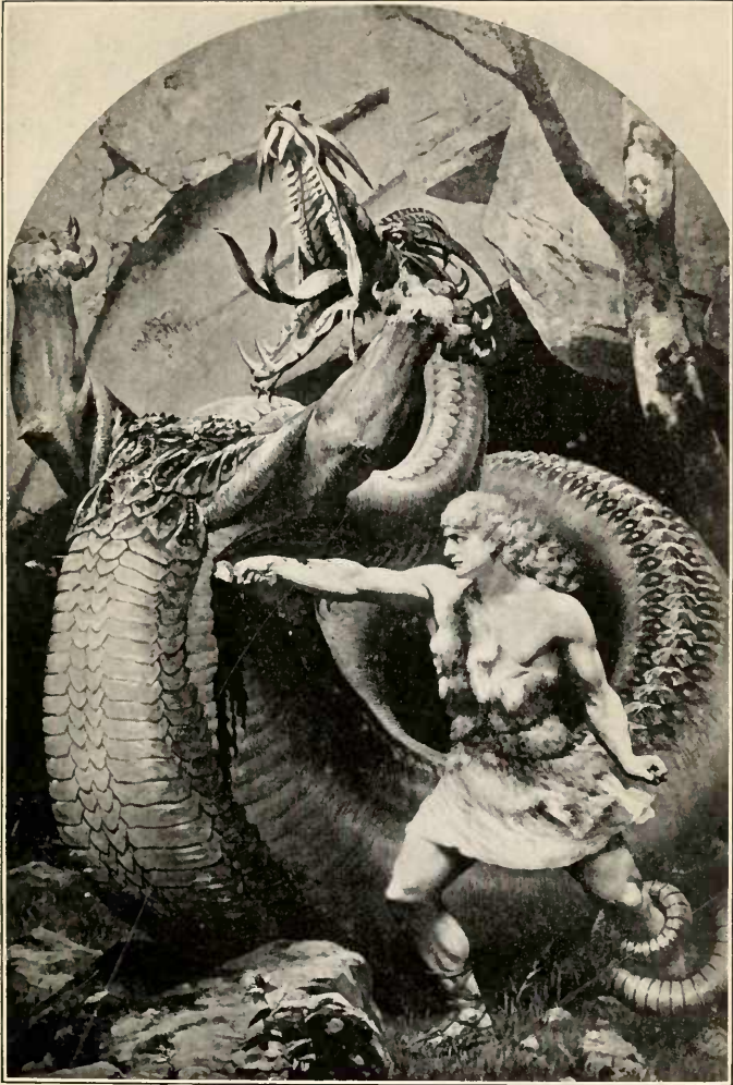
SIEGFRIED FIGHTING THE DRAGON