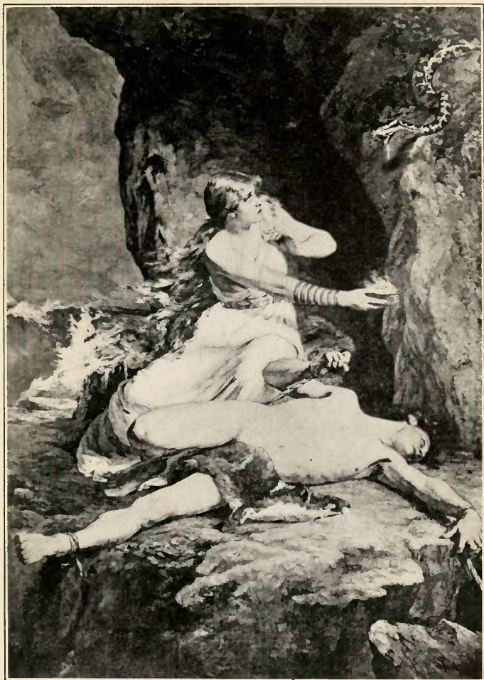
LOKI AND SIGYN