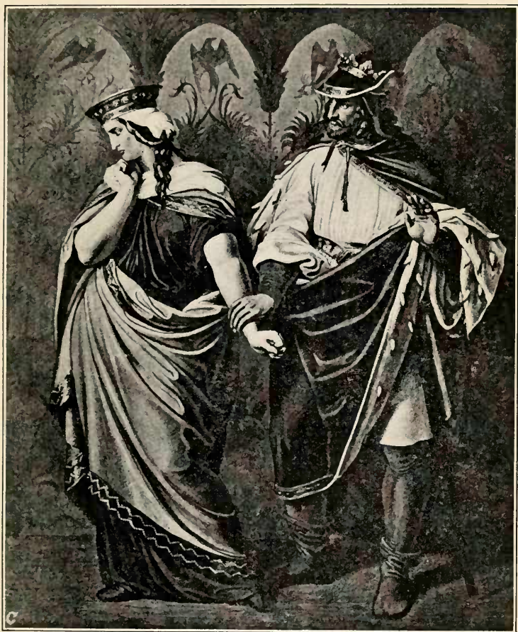
GUNTHER AND BRUNHILDE