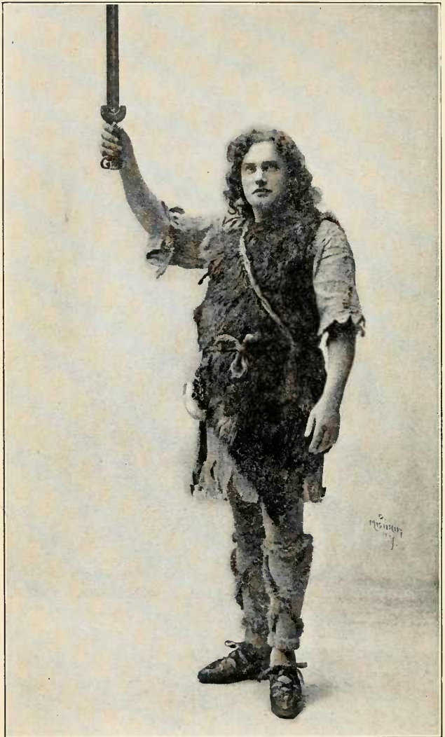
SIEGFRIED AND THE FAMOUS SWORD BALMUNG