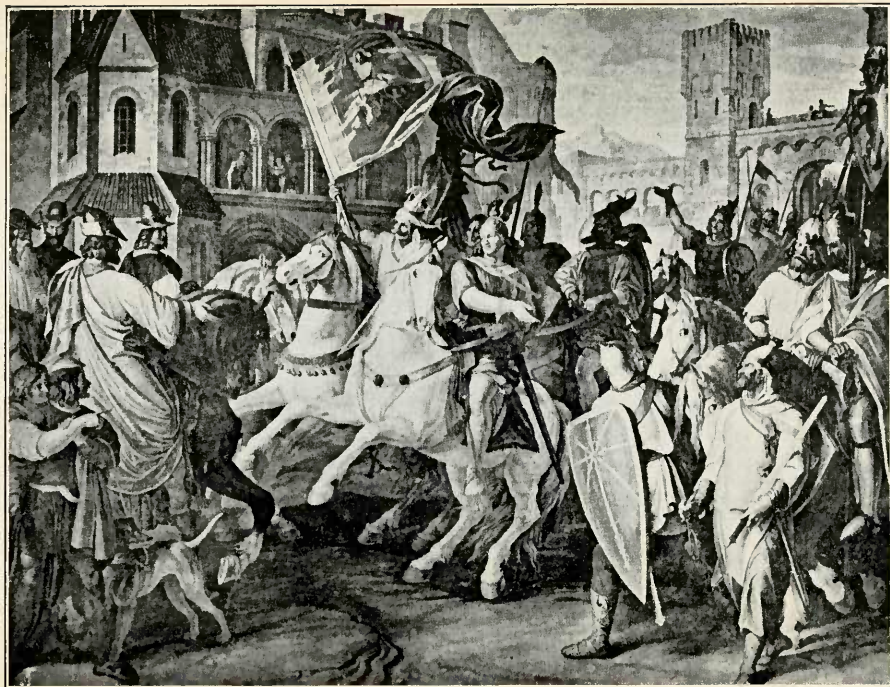
SIEGFRIED'S TRIUMPHANT ENTRY INTO BURGUNDY WITH CAPTIVES AND SPOILS