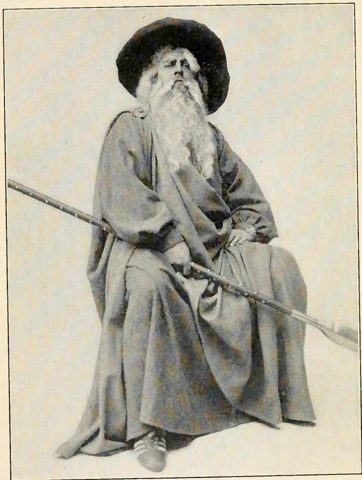
ODIN DISGUISED AS A TRAVELLER