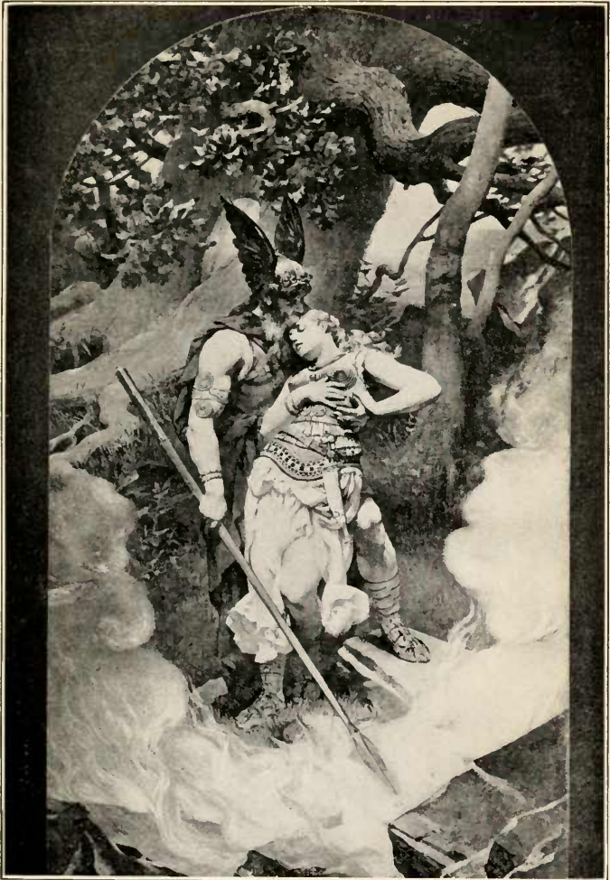
WOTAN'S FAREWELL TO BRUNHILDE