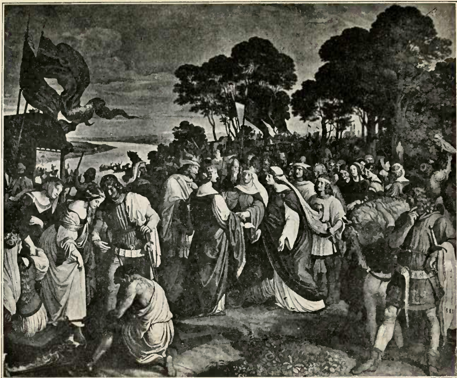
GUNTHER AND BRUNHILDE ARRIVE AT BURGUNDY AND ARE RECEIVED BY KRIEMHILD