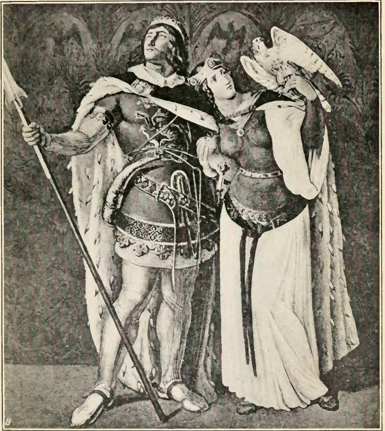
SIEGFRIED AND KRIEMHILD