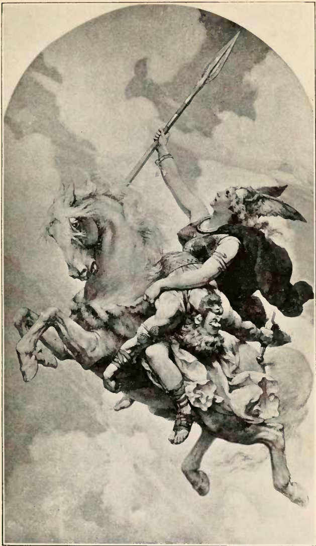
VALKYRIE BEARING HERO TO VALHALLA